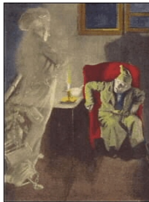
I know him; Marley's ghost!

His colour changed though, when, without a pause, it came on through the heavy door, and passed into the room before his eyes. Upon its coming in, the dying flame leaped up, as though it cried, 'I know him; Marley's Ghost!' and fell again.