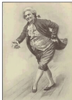
Then old Fezziwig stood out to dance with Mrs. Fezziwig

There were more dances, and there were forfeits, and more dances, and there was cake, and there was negus, and there was a great piece of Cold Roast, and there was a great piece of Cold Boiled, and there were mince-pies, and plenty of beer. But the great effect of the evening came after the Roast and Boiled, when the fiddler (an artful dog, mind. The sort of man who knew his business better than you or I could have told it him.) struck up 'Sir Roger de Coverley.' Then old Fezziwig stood out to dance with Mrs Fezziwig. Top couple, too; with a good stiff piece of work cut out for them; three or four and twenty pair of partners; people who were not to be trifled with; people who would dance, and had no notion of walking.