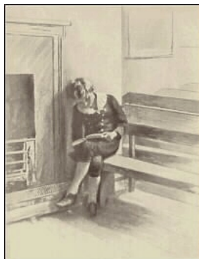
A lonely boy was reading by a feeble fire

They went, the Ghost and Scrooge, across the hall, to a door at the back of the house. It opened before them, and disclosed a long, bare, melancholy room, made barer still by lines of plain deal forms and desks. At one of these a lonely boy was reading near a feeble fire; and Scrooge sat down upon a form, and wept to see his poor forgotten self as he used to be.