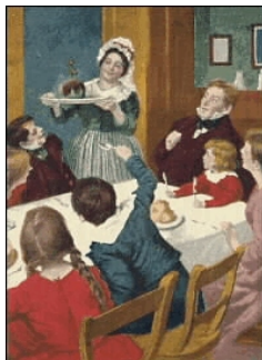
Mrs. Cratchit entered with the pudding

Hallo! A great deal of steam! The pudding was out of the copper. A smell like a washing-day! That was the cloth. A smell like an eating-house and a pastrycook's next door to each other, with a laundress's next door to that! That was the pudding! In half a minute Mrs Cratchit entered-flushed, but smiling proudly-with the pudding, like a speckled cannon-ball, so hard and firm, blazing in half of half-a-quartern of ignited brandy, and bedight with Christmas holly stuck into the top.